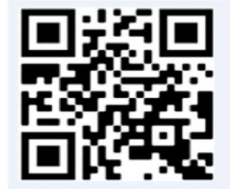
APPLICATION QR CODE